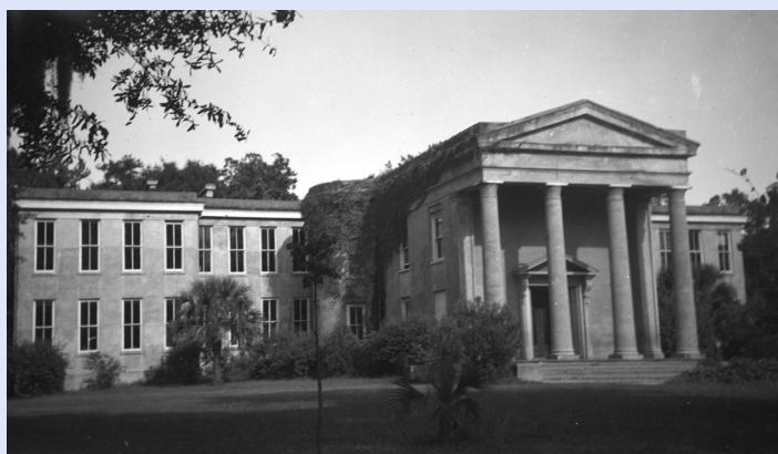
Historic photo of the Beaufort College Building with addition.