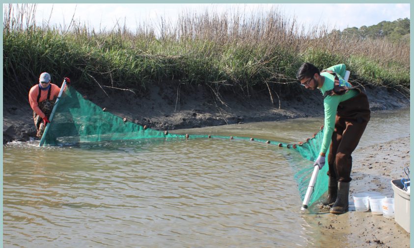
Seining for fish in the May River