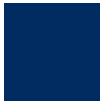
USCB Navy PMS 282 C

USCB Navy, Sand, and Intracoastal Blue are the official colors of the USCB Sand Shark identity system. USCB's primary color is Navy (PMS 282 C); the secondary color is Sand (PMS 466 C), and the tertiary color is Intracoastal Blue (PMS 631 C - at 90% value). It is extremely important to match the USCB colors faithfully. The USCB Intracoastal Blue may be especially challenging to replicate, but it is critical that it be matched as closely as possible.