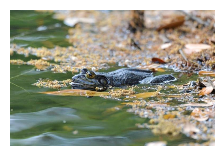
Bullfrog Reflection Lindsay Pettinicchi Medium: photography