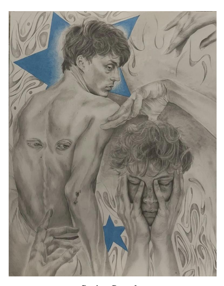
Savior Complex Lessle Rodriguez Medium: graphite and colored pencils on Bristol paper – 19x15"