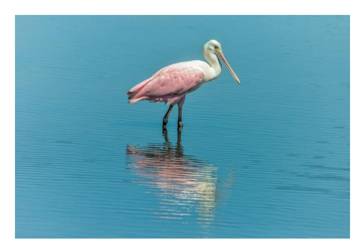
Roseate Spoonbill Reflection Lindsay Pettinicchi Medium: photography