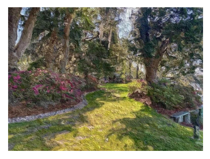
Downtown Bluffton Jen McCarty Medium: acrylic on canvas – 10x8"