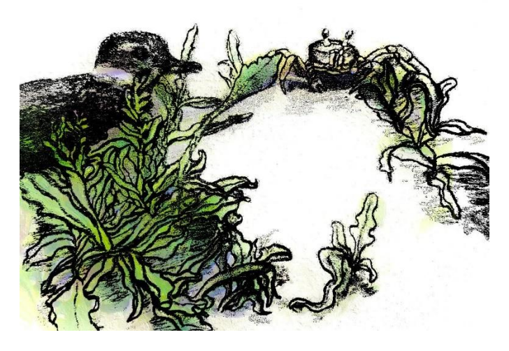
\begin{tabular}{ll} \textbf{Southeastern Searocket} \\ \textbf{Jen McCarty} \\ \textbf{Medium: pencil and markers on paper} - 10x8" \\ \end{tabular}