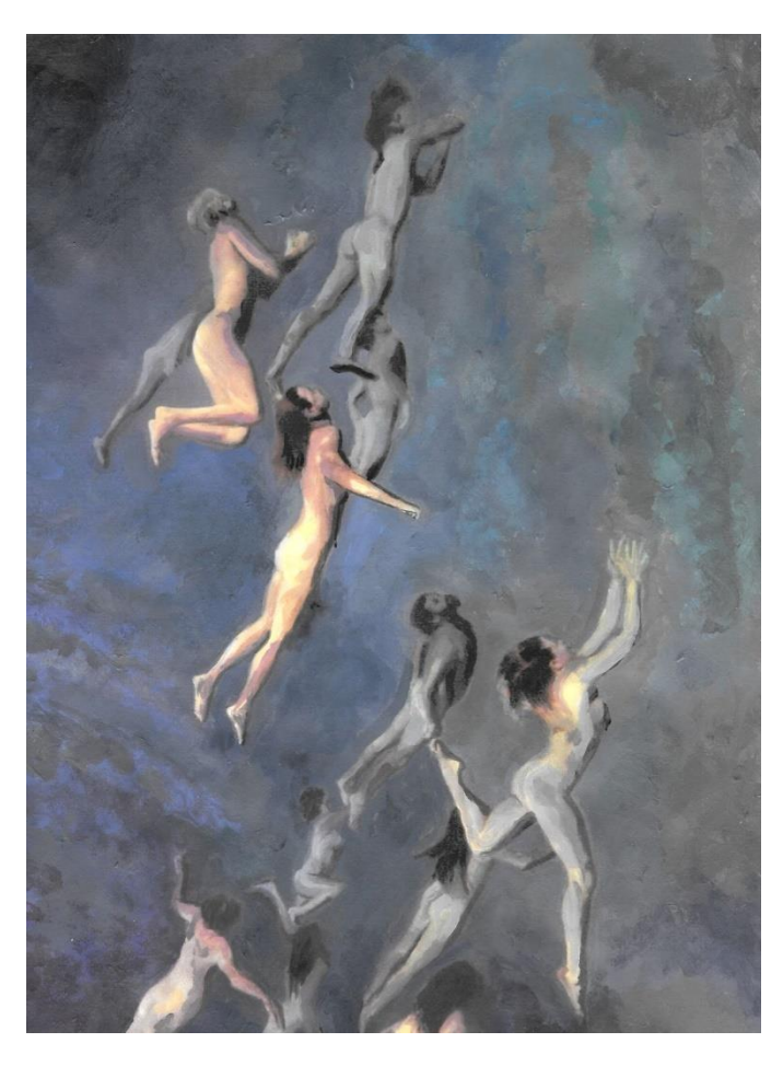
The Brine Jen McCarty Medium: acrylic on paper – 10x12"