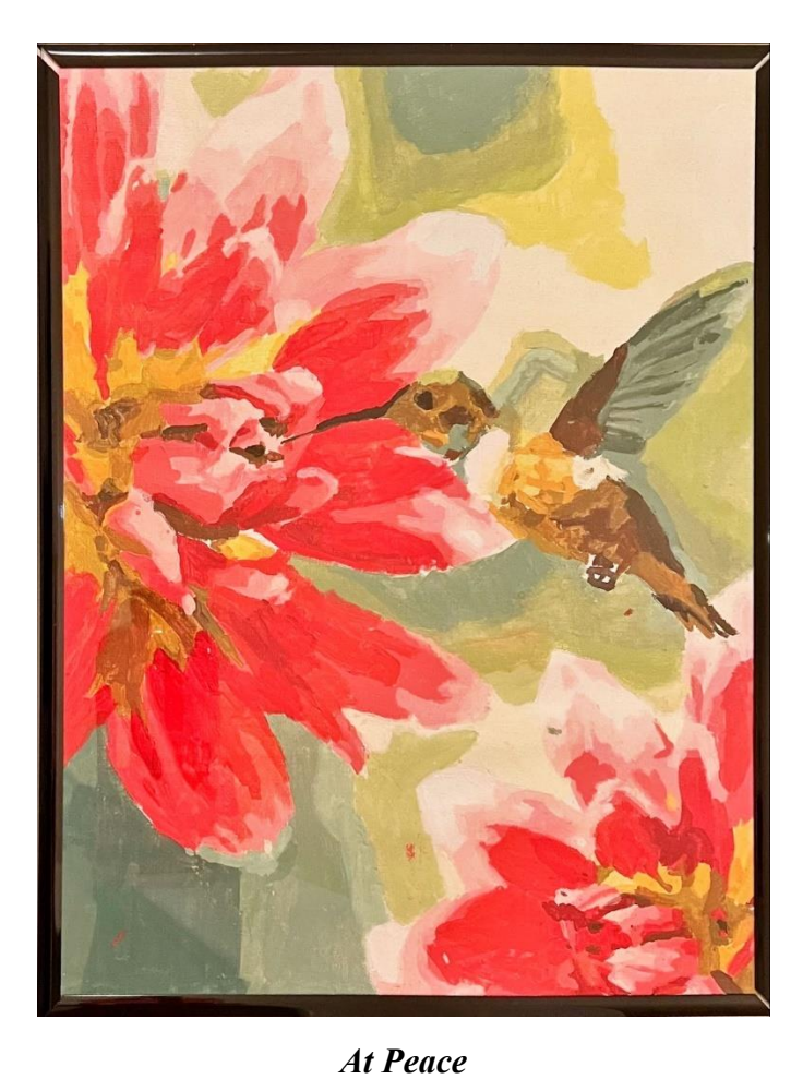
Lindsay Boyd Medium: acrylic on paper