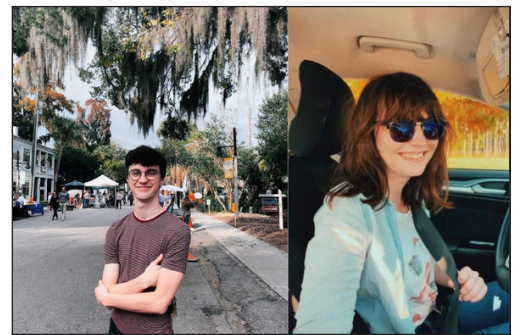
Two USCB English Graduates Accepted to MAT Program at Converse College